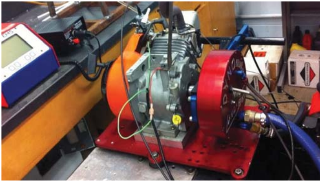
Figure 3. Motorsports Engine Testing Lab at ODU

maps to understand how they are created and how to use them. After this, friction and heat transfer is discussed. Many of the students in the course are also involved in the Formula or Baja motorsports teams, so they can apply what they learn right away. The following experiments are conducted during this class: torque calibration; manual dynamometer test with water brake dynamometer; sweep test for different throttle positions; air flow, air/fuel ratio, and fuel flow measurement; exhaust gas analysis; and, injector versus carburetor.