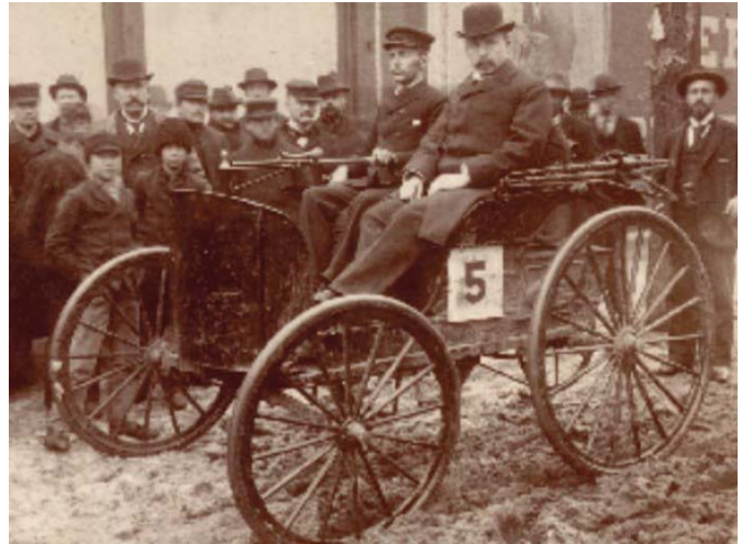
Figure 1. The First Car Race in the U.S. Held in Evanston, Illinois [2]

Various studies have shown an impact of the motorsports industry to manufacturing sectors in the U.S. and across the globe [3]. For example, in the state of Indiana, it contributes to more than 23,000 jobs directly and 421,000 jobs indirectly with annual wages around $63,000, which is well above the state average, as stated in a report by Purdue University researchers: “Race to the Future: The Statewide Impact of Motorsports Industry in Indiana” [3].