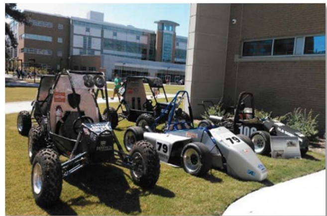
Figure 4. ODU Motorsports Fleet

ODU has participated in the Formula Society of Automotive Engineers (SAE) competitions since 1998. Each year, the team has requirements to design, build the vehicle, and participate in the competition with a formula-style racecar (see Figure 4). In addition to the design and build requirements, the team has to be involved in project management tasks to plan, coordinate, and verify the robust design of all car components, subassemblies, and assemblies. Main subassemblies are chassis, drivetrain, engine, suspensions, aerodynamic components, and controls. Components are designed to the manufacturing specifications, built, assembled, and integrated. Before the race, they are tested for durability and reliability [18].